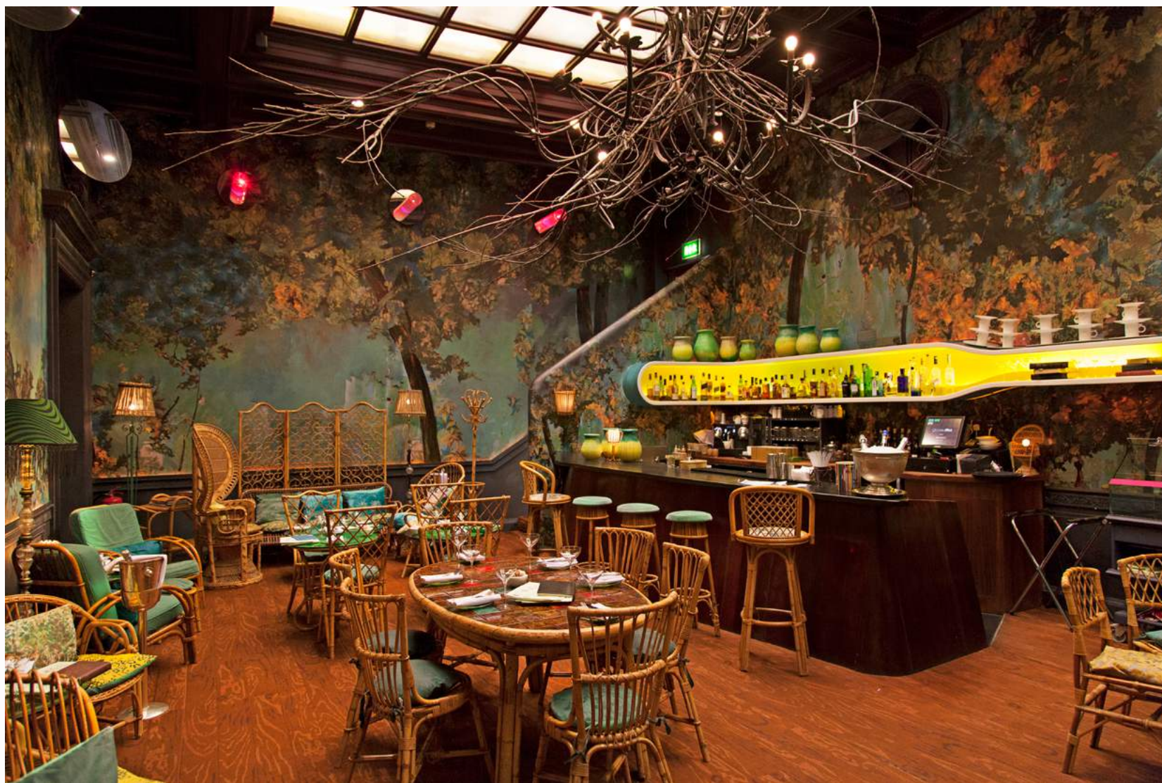
Sketch, London ↗