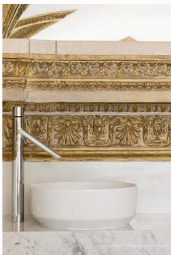
↑ OneFineStay, Rome