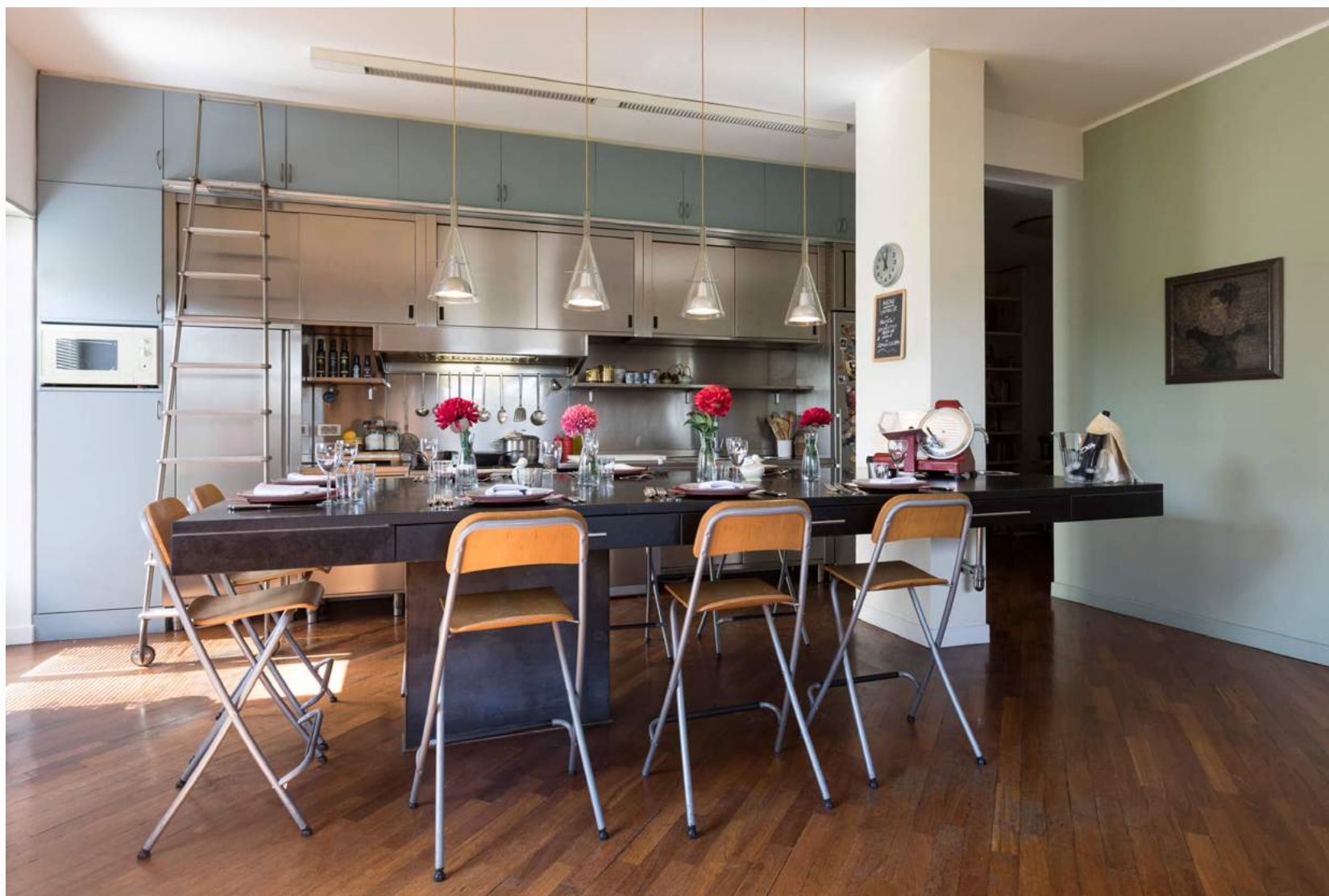
Eatwith, Rome ↗