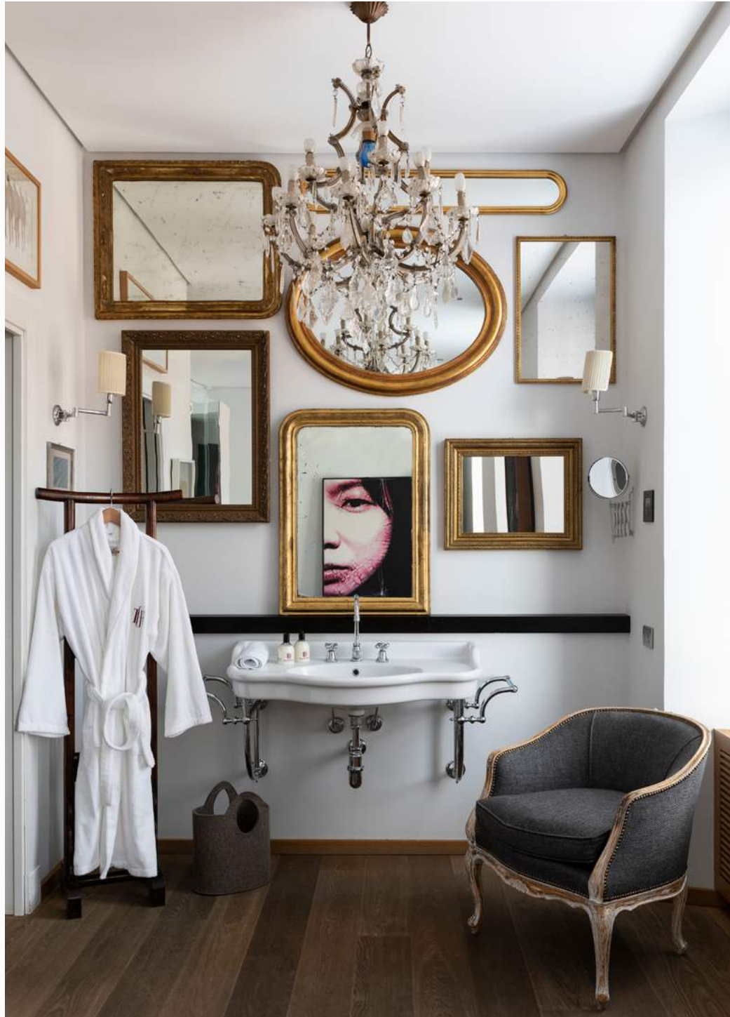
↖ The Grand House, Rome ↗