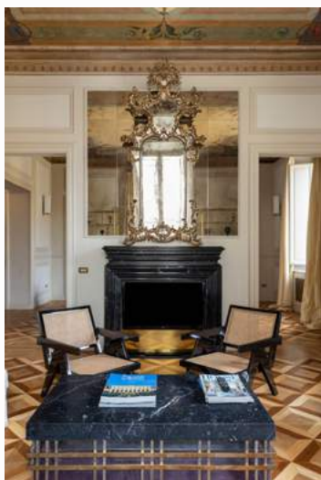
↑ The Grand House, Rome