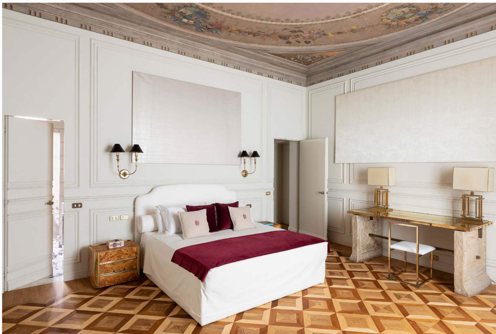
The Grand House, Rome ↗