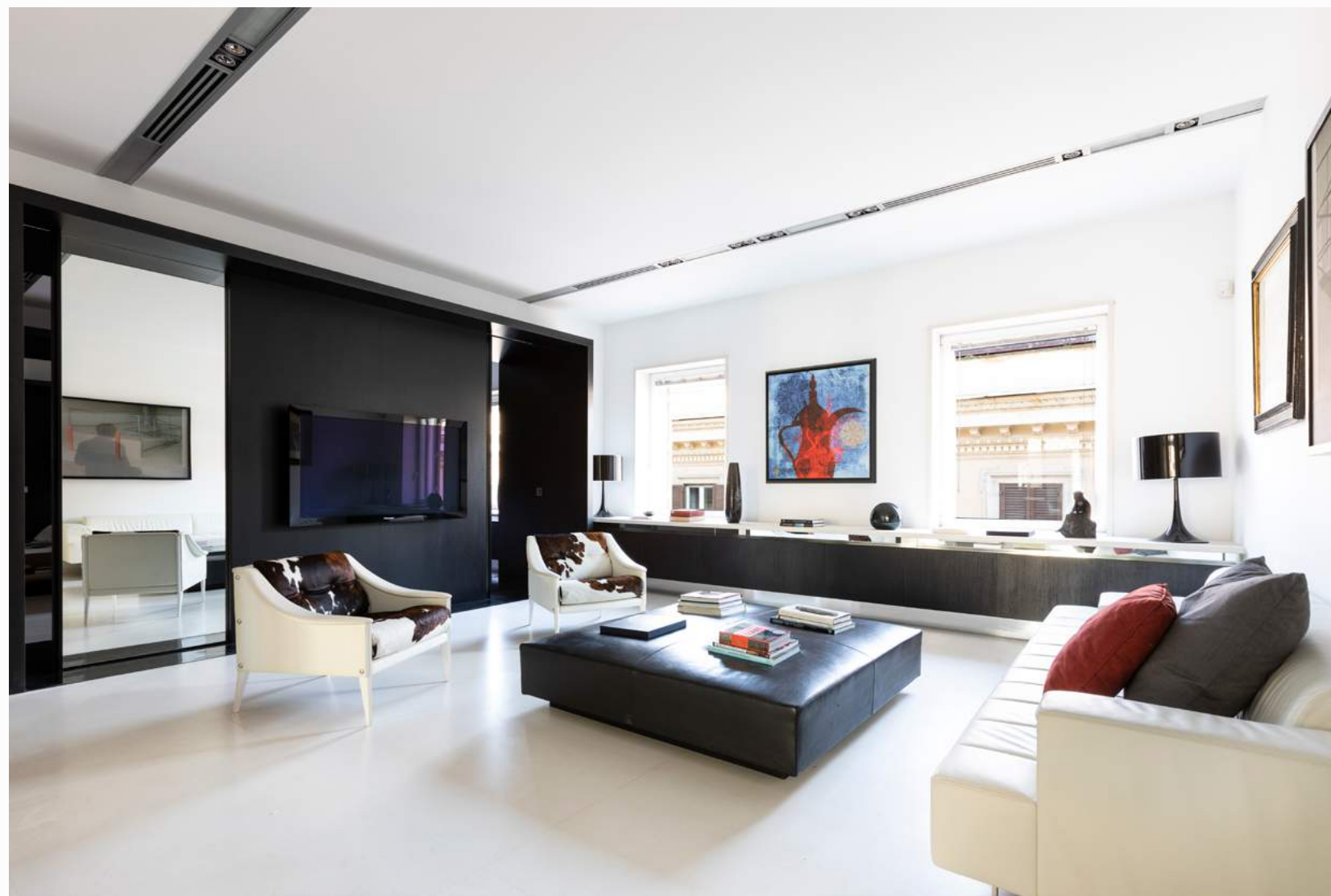
↑ OnefineStay, Rome