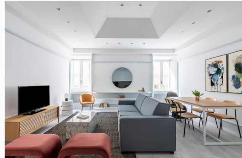
↖ Sonder, Rome ↗