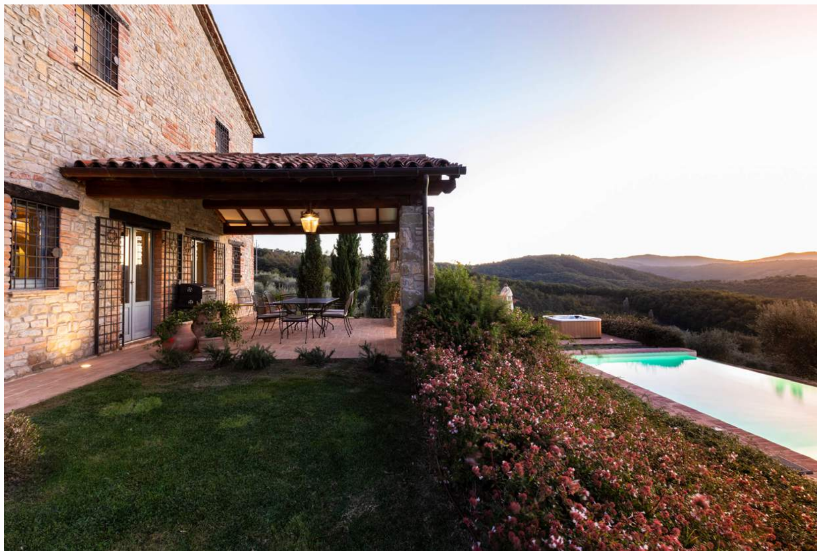
↑ Airbnb Luxe, Tuscany