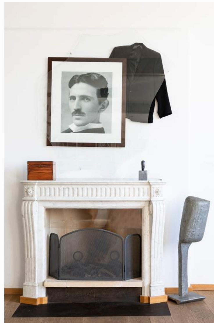
↑ The Grand House, Rome