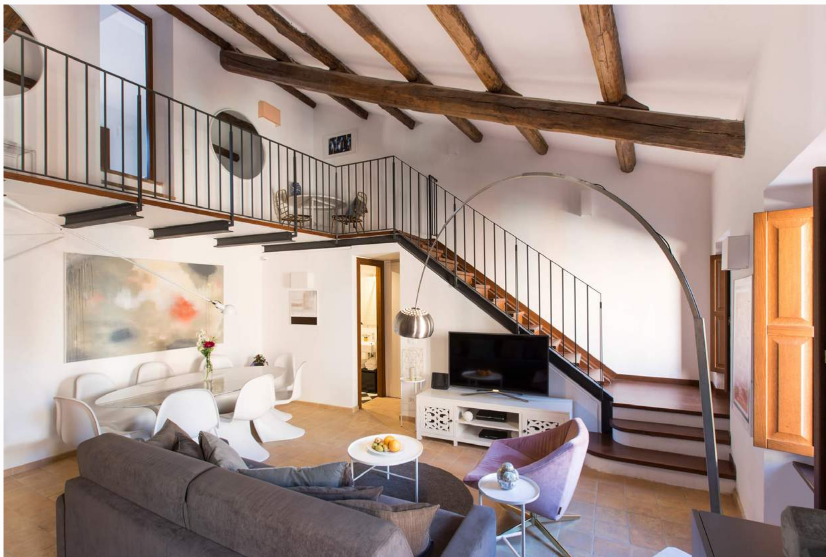
Palazzo Margana, Rome ↗