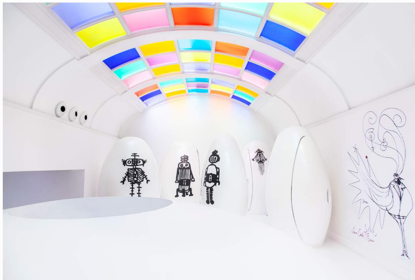
↑ Sketch, London