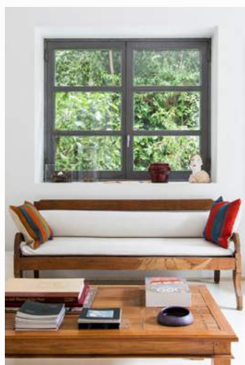
↑ OnefineStay, Rome